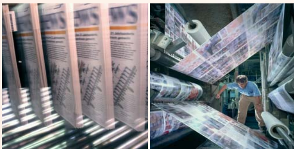
One cleaning head per web is all that is needed.

Today, blanket washing means that production has to be stopped and manual cleaning carried out. Occurring up to two times a day, it has growing effects on economy and efficiency. It also affects the working environment negatively since manual cleaning wears heavily on shoulders and arms. With Kelva's patented system for web cleaning, blanket washing can be limited to 3-4 times a month, meaning higher production output and better working conditions. Your printing professionals are able to concentrate on achieving top quality printing instead of using thousands of hours for cleaning.